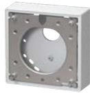
WV-QJB500-W Mount Bracket