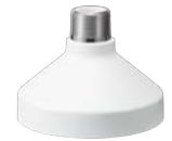
WV-QSR501M1-W Mount Bracket