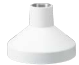
WV-QSR501F1-W Mount Bracket