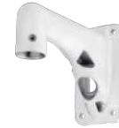
WV-QWL501-W Mount Bracket