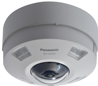
with Base Bracket