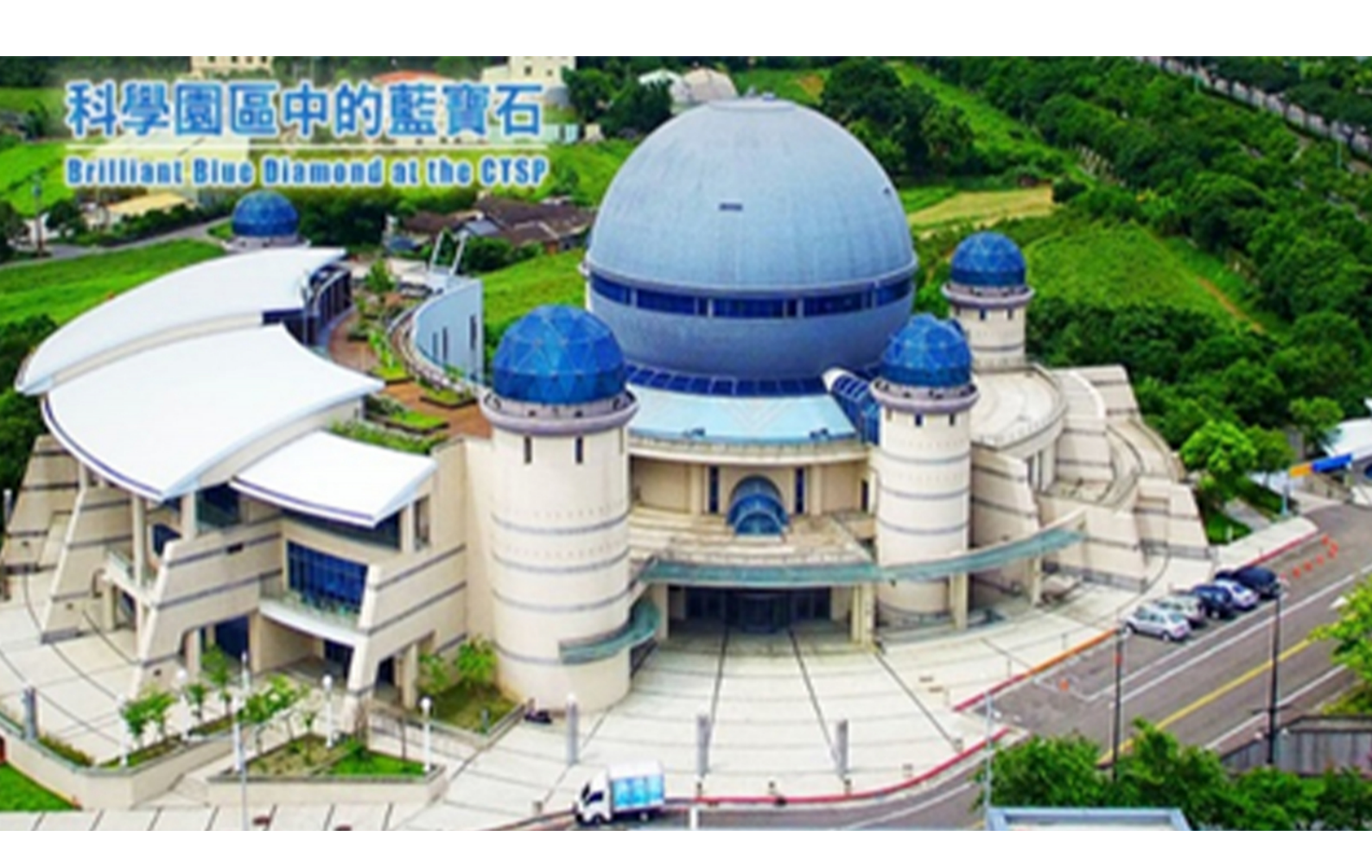
Al Robotics Hub / Taiwan