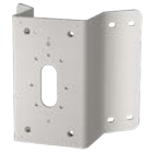
WV-Q183 Mount Bracket